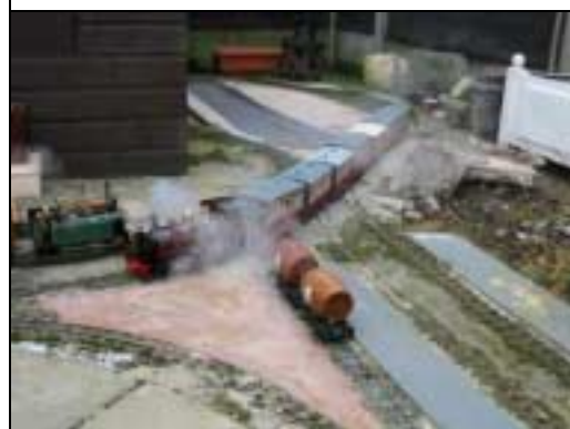
Millie waits for Russell to clear the return loop