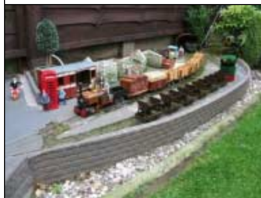
The line contains many scenic features