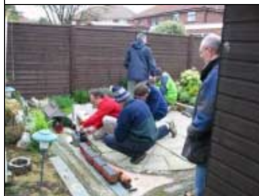
The LADS get involved at the top of the garden