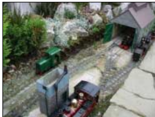
You could be looking down at 12" to 1 foot size